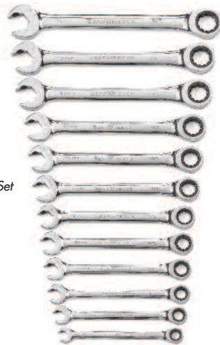
Metric Open End Ratcheting Wrench Set