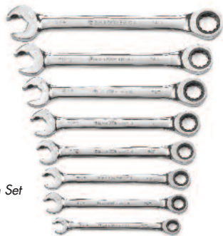
SAE Open End Ratcheting Wrench Set